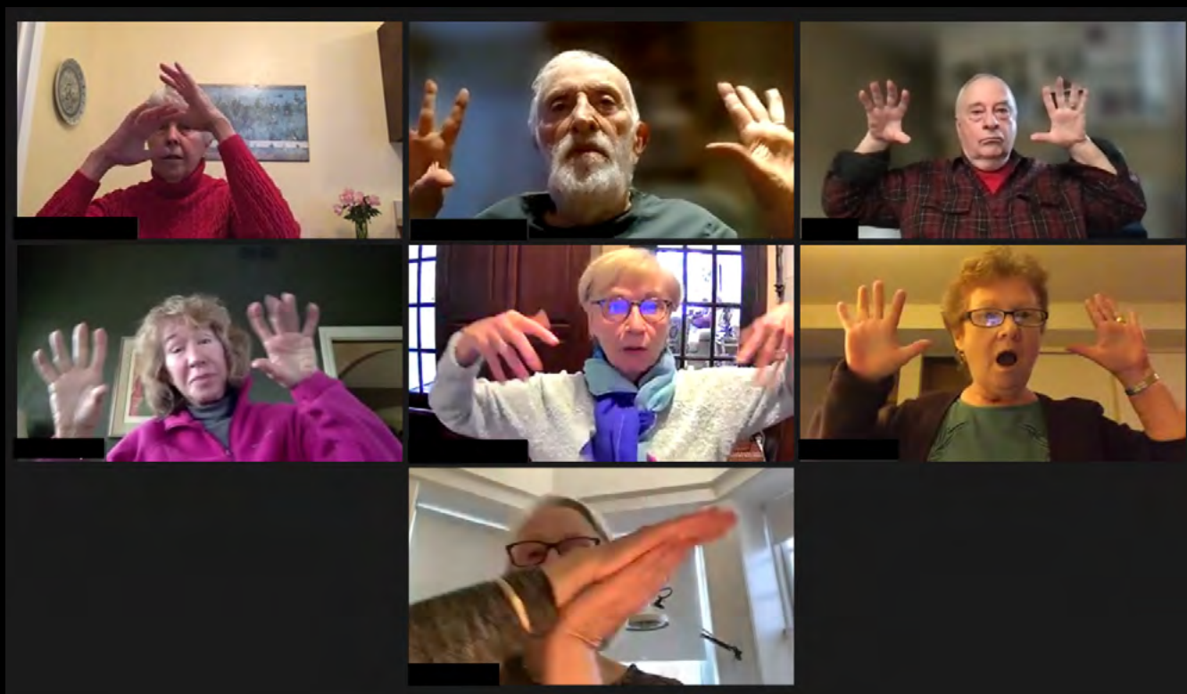
Capitol Hill Village students participate in a virtual class.