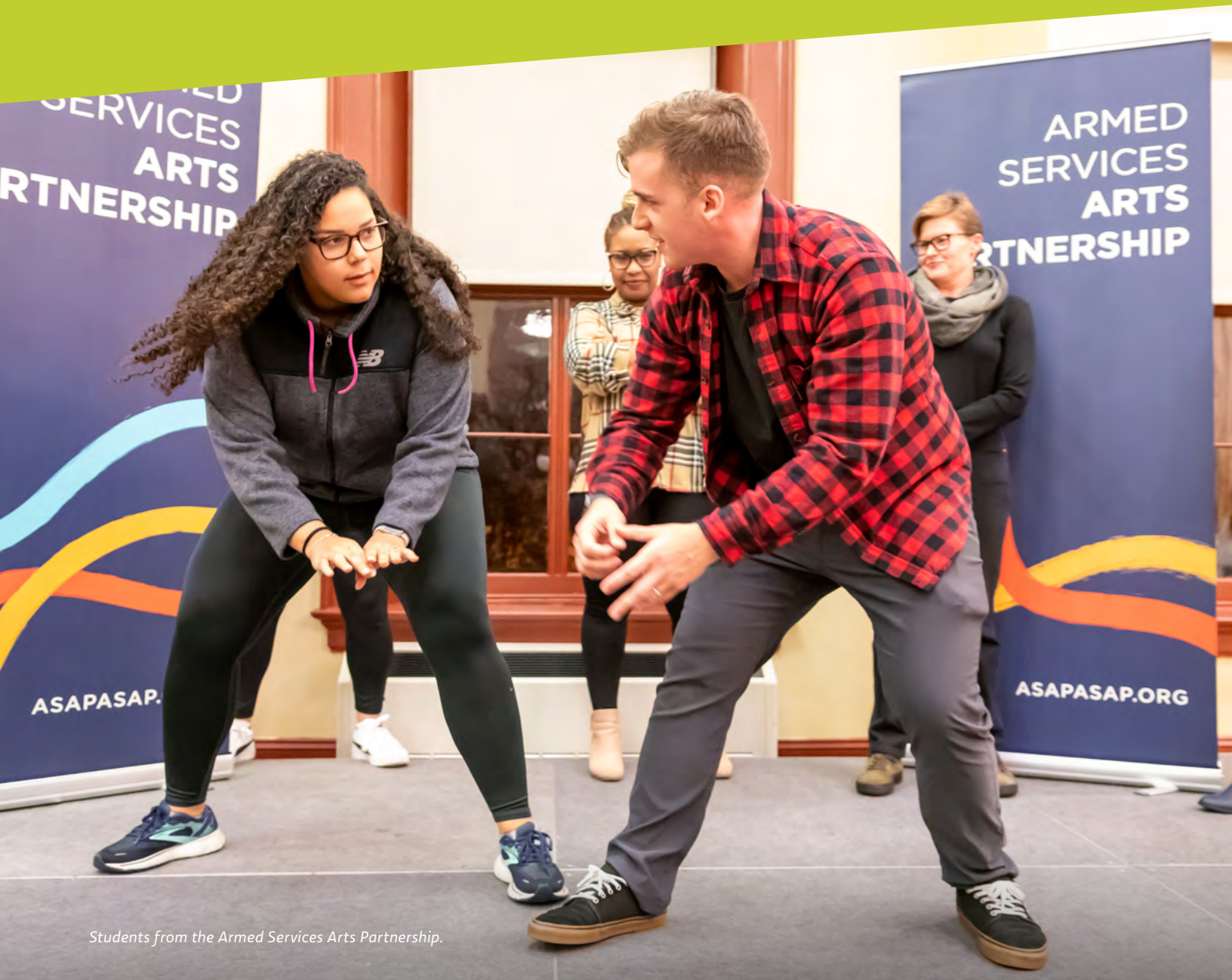
Students from the Armed Services Arts Partnership.